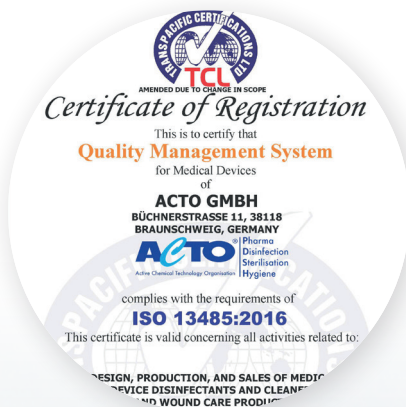
ISO 13485:2016 Quality Management System for Medical Devices