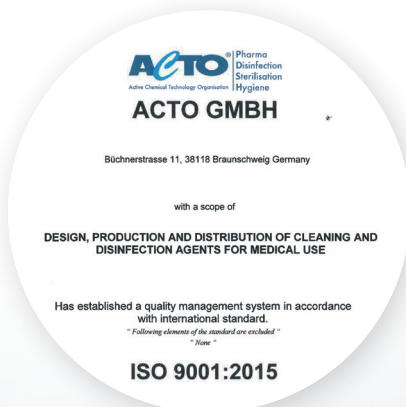
ISO 9001:2015 Quality Management System