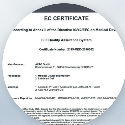
CE 93/42/EEC Full Quality Assurance System