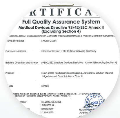
CE 93/42/EEC Full Quality Assurance System